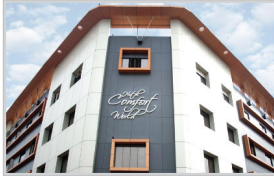
Hotel Comfort World