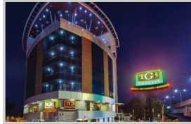
Hotel Titanium (TGC)