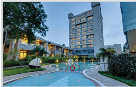
Boulevard 9 Resort & Spa