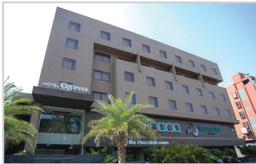
Hotel Cypress Canal Road, Nr. DDIT College (1.5 Kms)