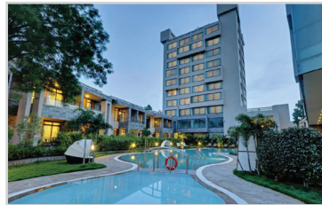
Boulevard 9 Resort & Spa Pij Cross Road, NH 228 (5 Kms)