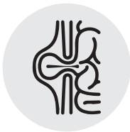
Pelvic Docking (for inguinal hernia)