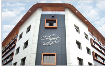
Hotel Comfort World Opp. MPUH (0 Km)