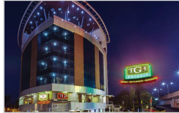
Hotel Titanium (TGC) Santram Dairy Road (0.5 Kms)