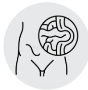
Lateral Docking (for ventral hernia)