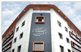
Hotel Comfort World Opp. MPUH 0 Km