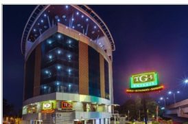
Hotel Titanium (TGC) Santram Dairy Road 0.5 Kms