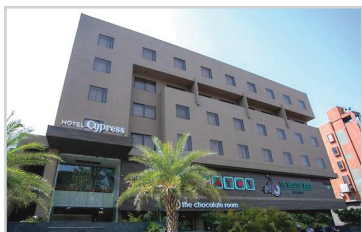
Hotel Cypress Canal Road, Nr. DDIT College (1.5 Kms)