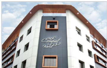
Hotel Comfort World Opp. MPUH (0 Km)