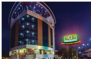
Hotel Titanium (TGC) Santram Dairy Road (0.5 Kms)