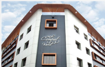
Hotel Comfort World