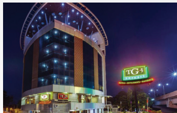
Hotel Titanium (TGC)