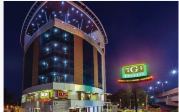
Hotel Titanium (TGC)