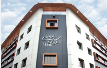
Hotel Comfort World